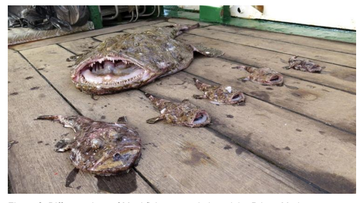
Figure 3: Different sizes of Monkfish captured aboard the Prince Madog

During the first year of the programme MERP has proactively engaged with the policy community at national and European levels through participation in workshops, sharing of scientific information and improving dialogue. Examples include: